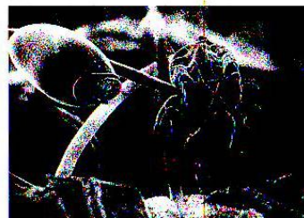
Magnified photo of the human head louse and louse egg (nit).

Head lice need to maintain contact with a host in order to survive. Those lice that leave the host voluntarily, or fall off, are likely to be damaged or approaching death (their life span is about 3 weeks) and so unable to start a new colony. There is no need to wash or fumigate clothing or bedding that comes into contact with head lice.