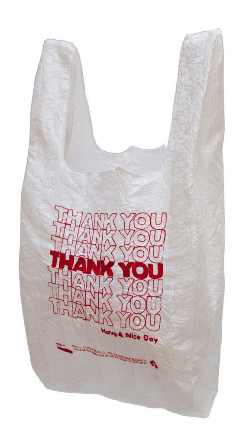
Plastic bags such as this are causing huge problems in our oceans.

We need to reduce the number of plastic bags in the environment. Making people pay will help to stop them using plastic bags and force them to use reusable bags for their shopping!