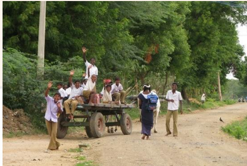
The children walk through the forest, then catch the 'bus' to school in the nearest town.