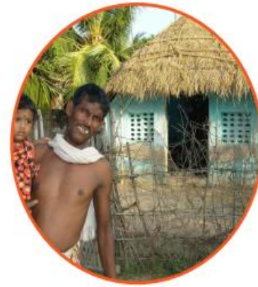
Chembakolli Village, India

Remember to write in full sentences using the conjunction 'because.' Can you try and write at least 5 sentences for each?