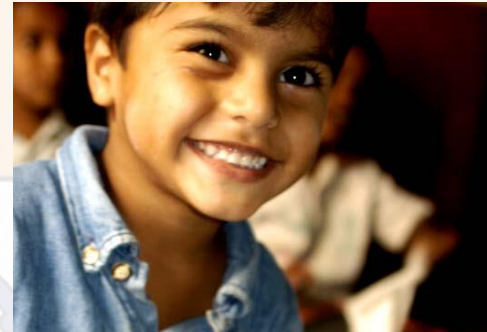
No electricity for TV, enjoy reading books from the mobile library.