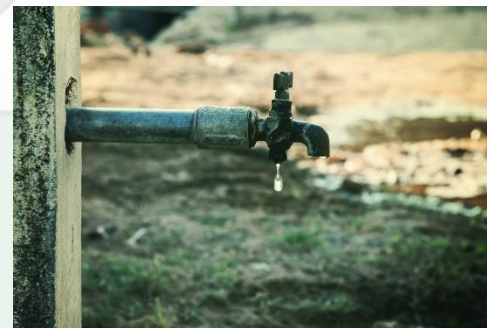
No running water