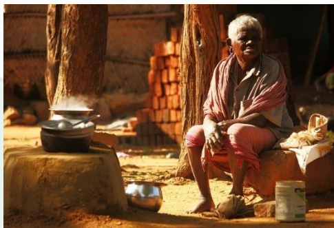
Cooking on an open fire