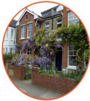
A street in England

Can you suggest why they are so different?