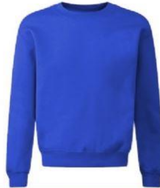
NURSERY Essential Sweatshirt CVPS