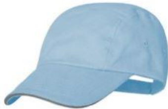
NURSERY Baseball Cap CVPS