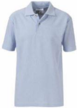
NURSERY Polo CVPS Logo Age 2-3 or 4-5