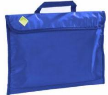
NURSERY Book Bag CVPS